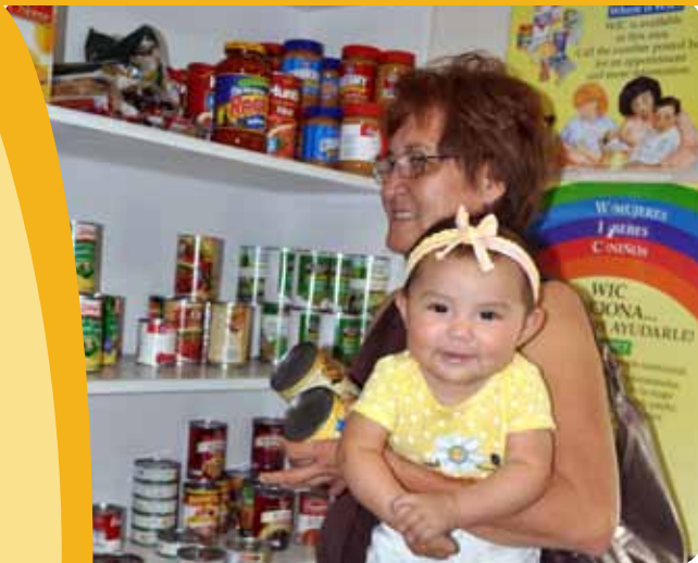
A busy year meeting increased demands!