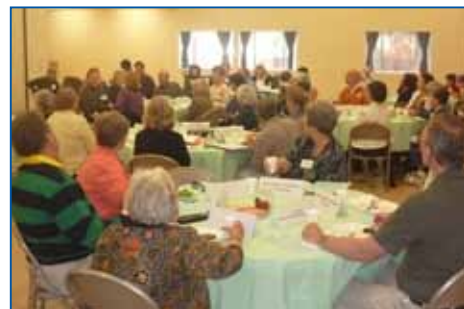
ICS Council meeting in January 2011

saying "thank you," we're happy to come speak to your congregation's mission, social action or caring group, men's or women's group, or during worship services. Or, we'd love to welcome a group from your congregation to visit ICS and see us in action.