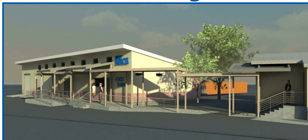
Artist rendering of new ICS Food Bank by The Architecture Company

Please join us at the Groundbreaking for the new ICS Food Bank building on Friday, April 29 .