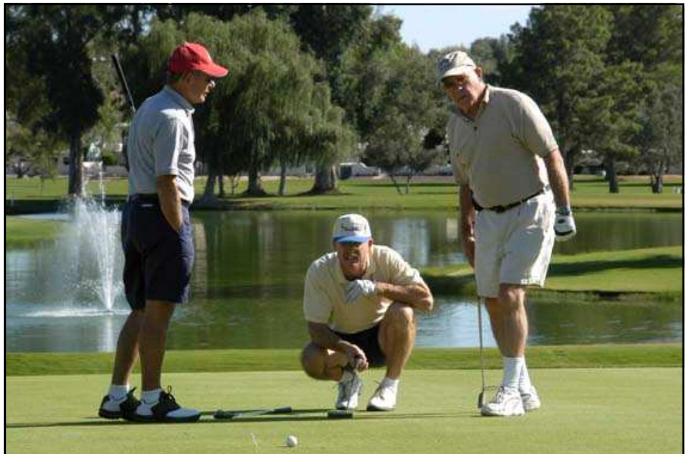
A full field is expected again at this year's event.

The "We Care" Golf Classic has a great reputation for wonderful raffle items and this year is no exception. There are two hole-in-one prizes this year - a new Jim Click car and a Steinway Grand Piano! Other raffle and prize items include a golf outing and stay at the Broadmoor in Colorado Springs, a pair of Southwest Airlines tickets to anywhere in continental USA,