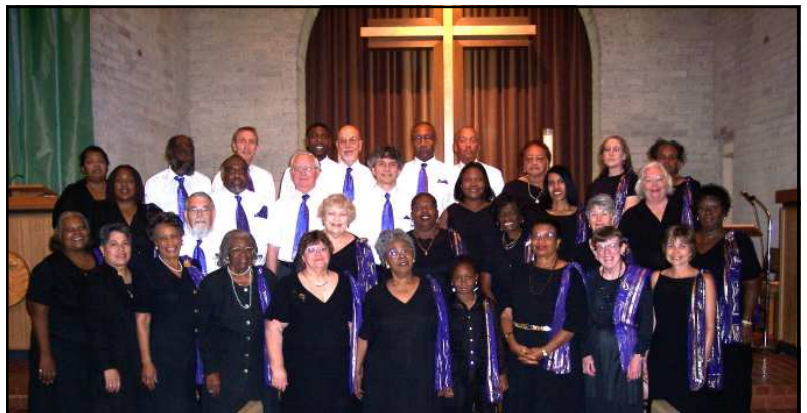
The Tucson Mass Choir performs gospel music.