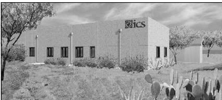
The Architecture Company artist’s rendering of new ICS wing