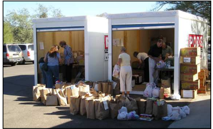
Last year's Holiday Food program set a record.

Gifts of Love. This program helps connect indi-