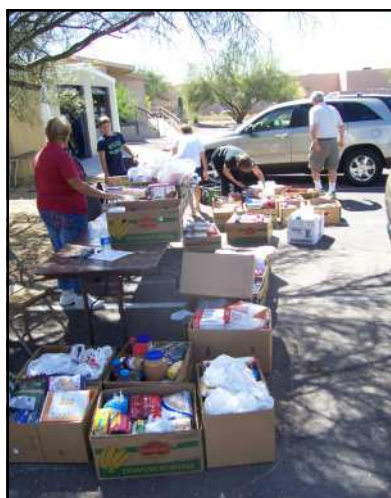
Volunteers from the Church of the Apostles sort food at ICS.

T he ICS Food Bank recently received a much-needed "booster shot" as it braces for another long hot summer.