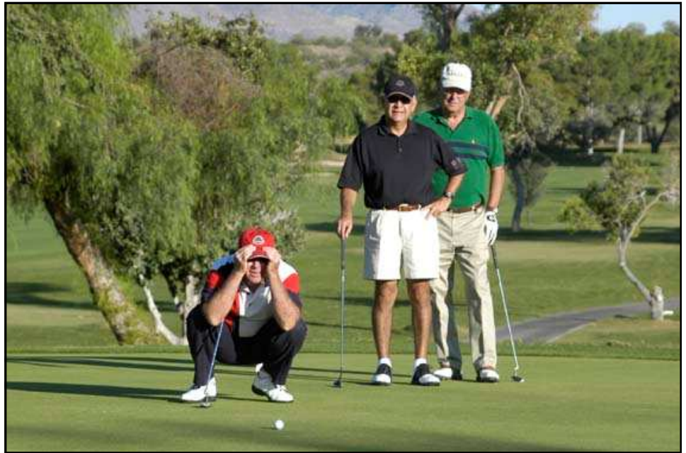
The annual "We Care" Golf Classic features some serious golf, as these participants demonstrate.

November is still a ways away, but it isn't too soon to start recruiting your foursome. Last year's event sold out with a field of 144 players.