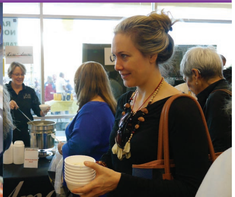
Something for all tastes: Guests sampled soups, breads and desserts from more than 20 area restaurants and food partners.