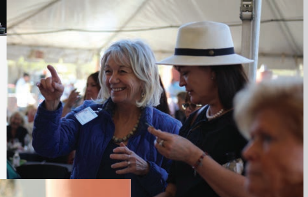
Anticipation as the Raffle closes