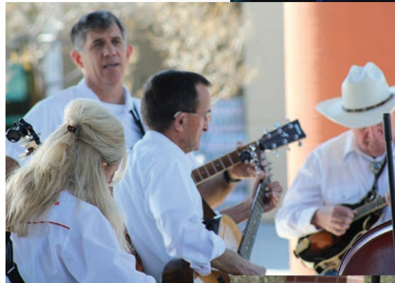
Wonderful entertainment provided by Ocotillo Rain & Thunder Bluegrass Band