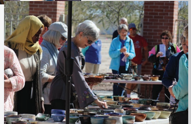
Selecting beautiful bowls was the highlight of the day