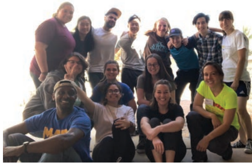
Granada Hills Friends Church from California painted the new Southside Office.

Northwest Community Friends Church sent a group