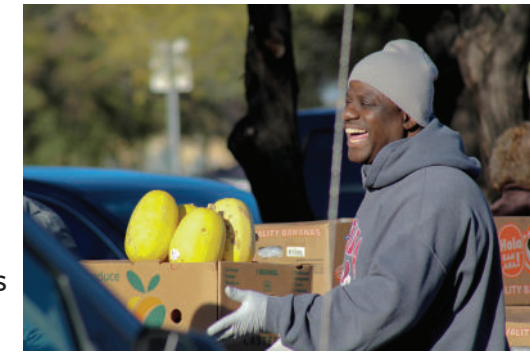
Produce giveaway at Desert Dove Christian Church

ICS welcomes our newest partner faith communities! St. Michael the Archangel Ecumenical Catholic Church, Unleashed Church, and Tucson Church International are all very excited to be partnering in service with ICS. These faith communities and their members are quickly getting involved with ICS in various ways and look forward to continuing their participation.